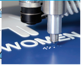
ADA Braille Sign