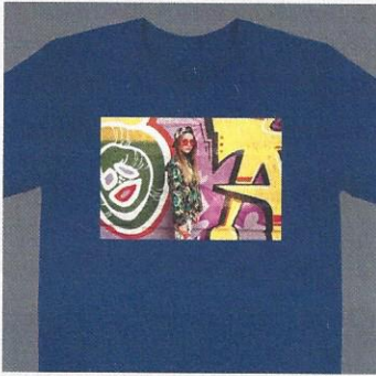
Produced with: LASER 1 OPAQUE®